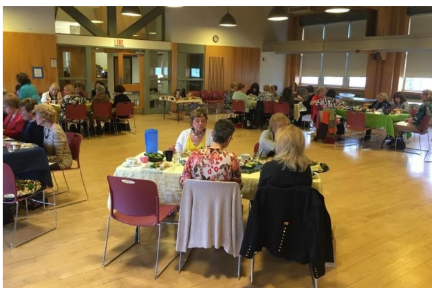
Friends of the Library tea held in the Community Room.

*The use of Library facilities does not constitute the Library's endorsement of viewpoints expressed by the users, and any advertisement or announcement implying such endorsement is prohibited and may result in cancellation of the room use.