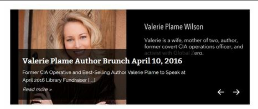
Valerie Plame Author Brunch and Fundraiser -SUNDAY, April 10 at 11 am at Philmont Country Club

Tickets ($60) are <u>Now Available</u> online through PayPal or at the Library. You can register via the <u>new online calendar</u>.